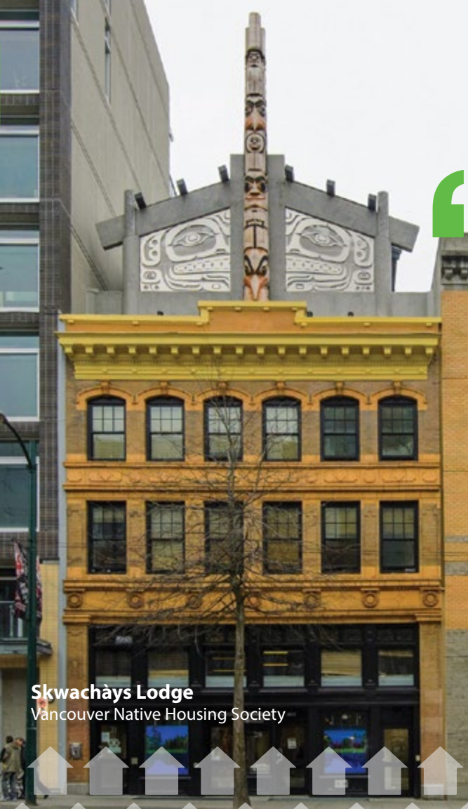
Skwachàys Lodge Vancouver Native Housing Society

“BCNPHA works with leading businesses to customize money-saving programs for the community housing sector. We look after the research and vetting so that our members can simply enjoy these exclusive deals while strengthening the sector.”