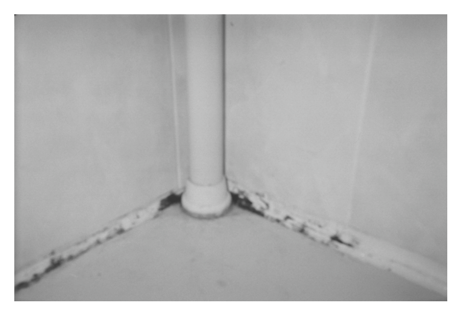
Figure 3: Photograph taken by a participant

the judge said "No, she doesn't have to pay because you guys did not fix the problem, and that's really unsafe and unsanitary."