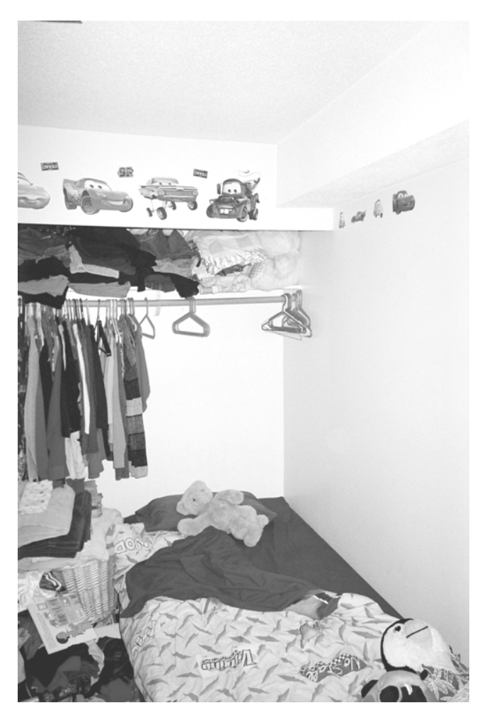
Figure 2: Photograph taken by a participant

[These pictures] show [my son's] room, in the closet ... We have nowhere to put [the laundry] because he's in the closet, and he can't use the whole closet because his bed is in there.